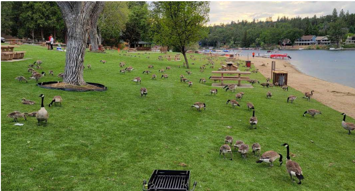
Figure 1. Canada Geese grazing the lawn at the Marina swim area, spring 2022.

As the largest geese in the world, they typically eat aquatic plants and grains, and occasionally eat fish and insects. They mostly eat grasses, so manicured lawns are attractive. Geese provide ecological services such as dispersing insects and seeds, feeding predators, and recycling nutrients. But in many areas their disservices outweigh their services (Buij et al., 2017).