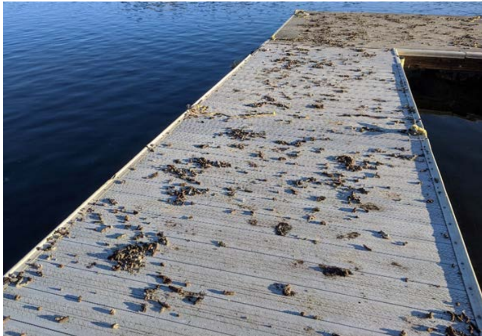
Figure 3. Geese feces on a marina dock, spring 2021.

More intensive geese management is warranted when Canada geese damage golf courses and community parks; reduce water quality; and endanger human life at beaches, roads and airports. Key thresholds that drive more intense activity and more drastic measures include: