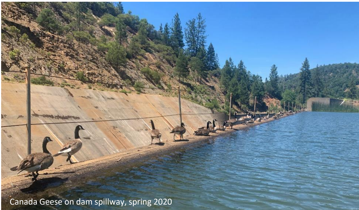
Canada Geese on dam spillway, spring 2020