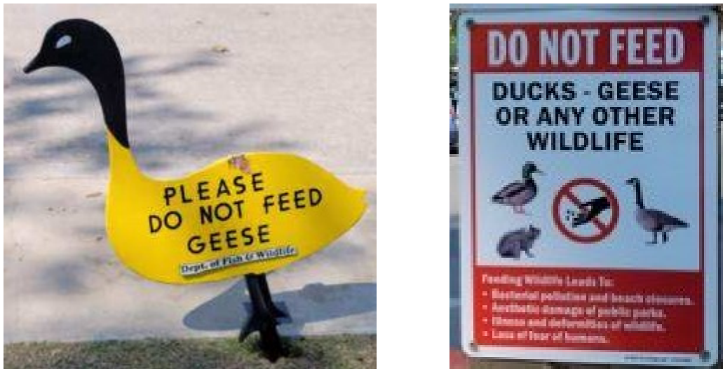
Figure 4. Signs posted at prominent at PMLA lake facilities.

PMLA posts signs at all lake access facilities. The key message, consistent with those described in section 2.1, is to not feed geese or other wildlife ( Figure 4 ). Warning signs are posted when the beach areas are closed because of pathogen indicator exceedances.